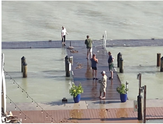
An unusual scene before Hurricane Helene churned by offshore.