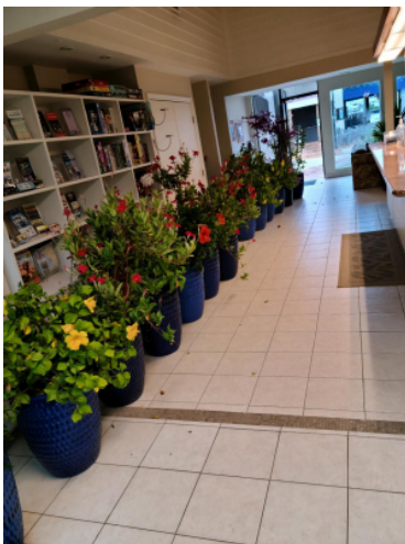
A new sanctuary for flowering plants

The staff began working through our detailed Hurricane Preparation checklist days ago and finished up around Noon today.