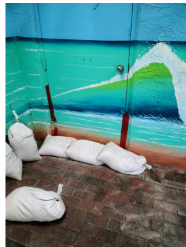
Protect the elevator room!