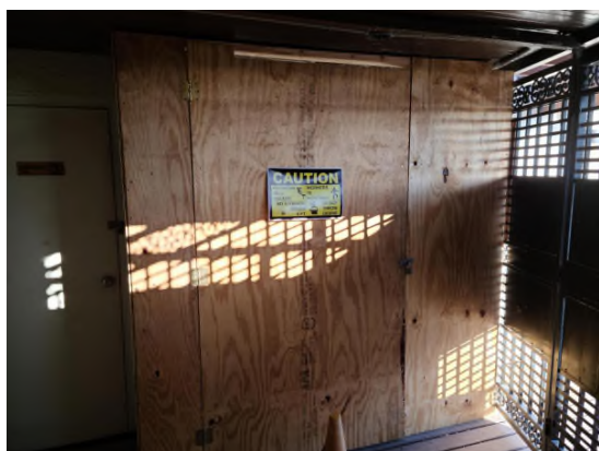
Roof top boarded up