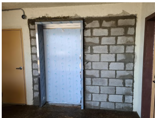
6th floor concrete work