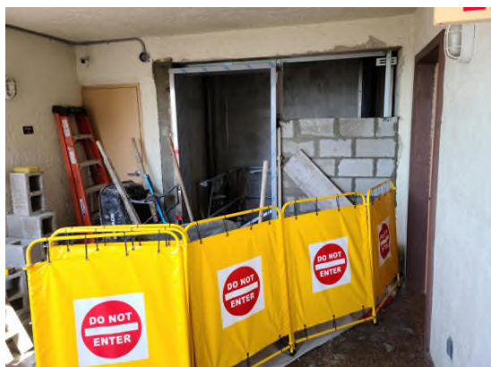
7th floor barricades