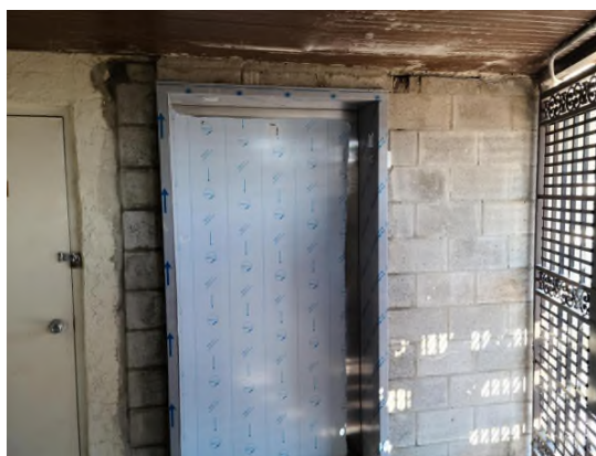
Roof top doors revealed

"While you're in there, why don't you...?"